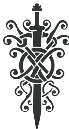
TYR Animals Community Defence Self-sacrifice