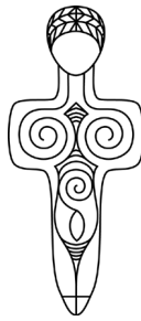
FREJA Fertility open mind tolerance love