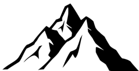
NJORD The Elements Wild Nature Selfless Meditation