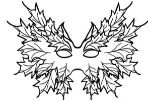
LOKE Trickster Changeability Inventive Creative