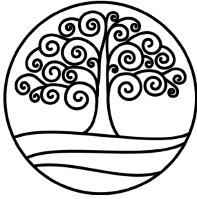
IDUN Athletic Industrious Persistence Perfection