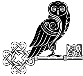
FRIG Knowledge Foresight Protector Household