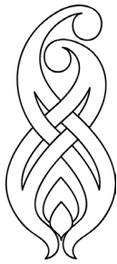
BALDER Beauty Artistic Innovation Abstract