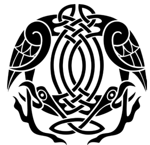
ODIN Traditions Conservativ Individualist Status Quo