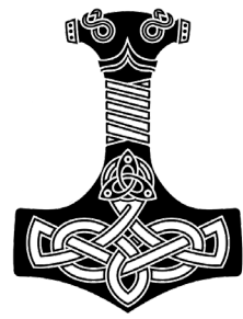
THOR Brute strength Rashness Stubbornness Bravery