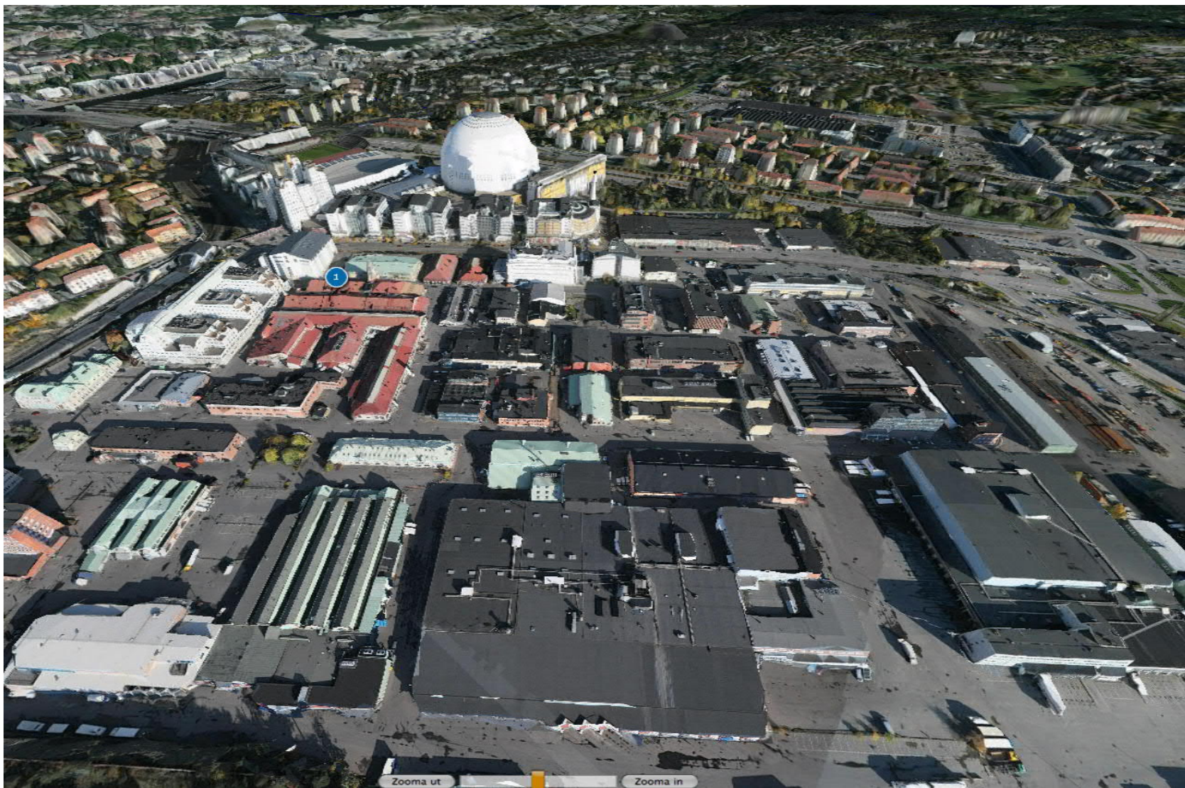
Vy, Slakthusområdet anno 2010