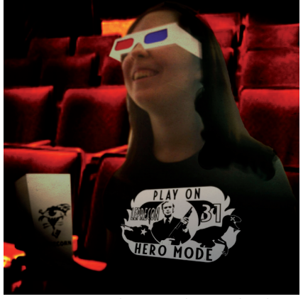
leprecon T-Shirts, available in sizes from Babydoll to XXL! only I O Euro longsleeves available for 15 euro