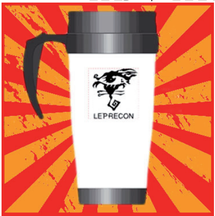
leprecon limited edition thermal mugr...comer with tea or coffee! 8 Euro